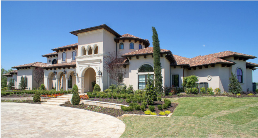
The Resort Blvd Home - Fort Worth, Texas