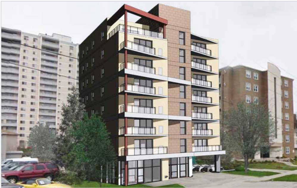
28 University Ave Student Residence - Waterloo, ON