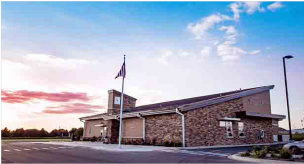
Farmington Library - Farmington, Illinois